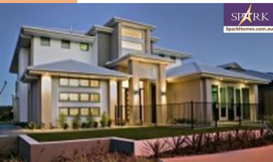
Two Storey Home : 423