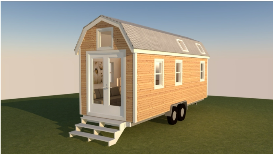
The SPARK - Cadden

The SPARK Cadden is a 7 Meters long tiny house on wheels with a gambrel roof. It has a bathroom sized to fit a square shower stall, composting or standard toilet, and standard sized vanity sink. Just outside the bathroom is a closet and space for a stackable washer & dryer. In the main living space a kitchen could be placed along one wall. French front doors provide access also feature wide flip-up steps.