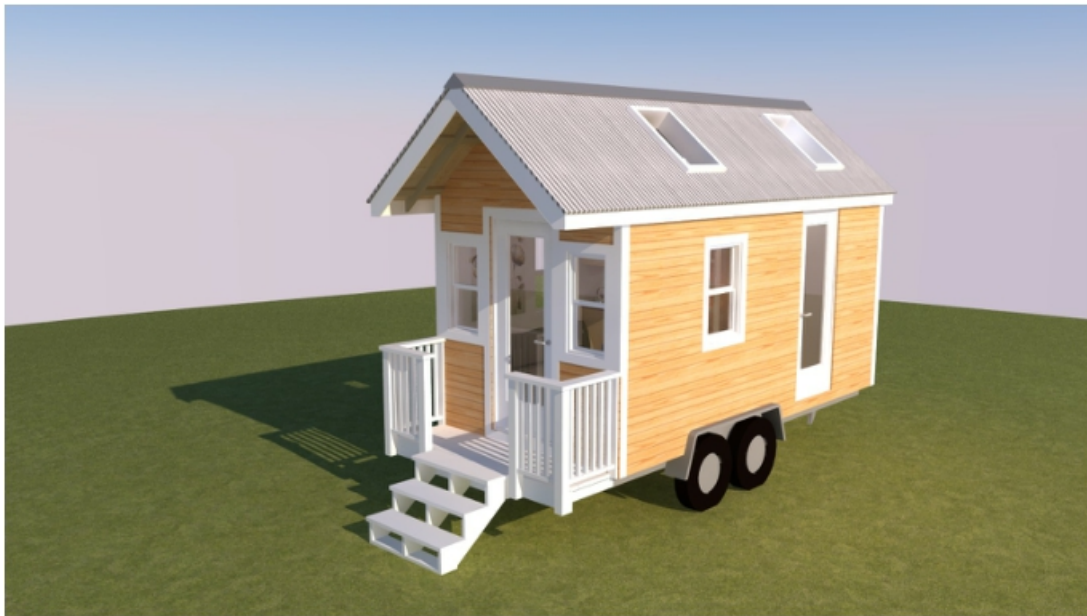
The SPARK - Camellia

The SPARK Camellia is a 4.8 Meters long tiny house on wheels with a 10/12 gable roof. It has a bathroom sized to fit a square shower stall, composting or standard toilet, and small wall mounted sink. A small kitchen would be placed just outside the bathroom. A sleeping loft above the bathroom & kitchen space provide enough space for a queen-sized mattress. Outside the front door are flip-up steps and an extended eave that covers the railed porch.