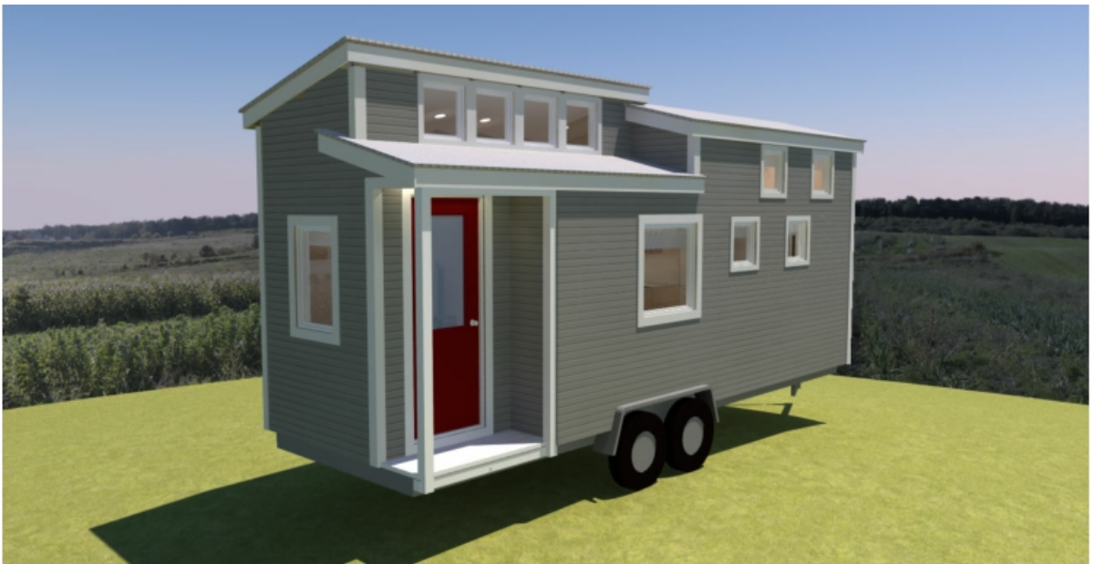
The SPARK - Chester

The SPARK Chester is a 7 Meters long tiny house on wheels and features two roof styles and an entry porch. One side of the house has a clerestory between two opposing pitched roofs. The other side of the roof has a pitch which provides a lot of added headroom in the sleeping loft. The ceiling is high enough in this design to use a staircase to access the loft.