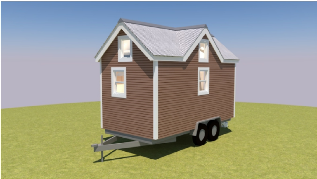
The SPARK - Creek

The SPARK Creek is a 4.8 Meters long tiny house on wheels with a 10/12 gable roof. It has a bathroom sized to fit a square shower stall, composting or standard toilet, and small wall mounted sink. A small kitchen could be placed in the center of the house. A sleeping loft above the bathroom & kitchen space provide enough space for a queen-sized mattress. Two skylights and a small window open to provide ventilation in the loft