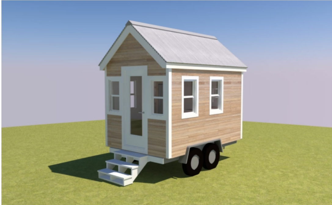
The SPARK - Cromer

The SPARK Cromer is a 3.6 Meters long tiny house on wheels with a 10/12 gable roof. It has a bathroom sized to fit a square shower stall, composting or standard toilet, and small wall mounted sink. A small kitchen could be placed in the center of the house. A sleeping loft above the bathroom & kitchen space provide enough space for a queen-sized mattress. Two skylights and a small window open to provide ventilation in the loft.