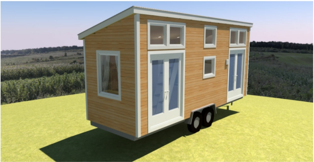
The SPARK - Curl

The SPARK Curl is a 7 Meters long tiny house on wheels with a 3/12 shed roof. It has a bathroom sized to fit a square shower stall, composting or standard toilet, and small wall mounted sink. Just outside the bathroom is a small kitchen. At one end of the house is a small bedroom ideally sized for a double bed – but could tightly accommodate a queen bed too. A sleeping loft is above the kitchen and bathroom with access from the main living space.