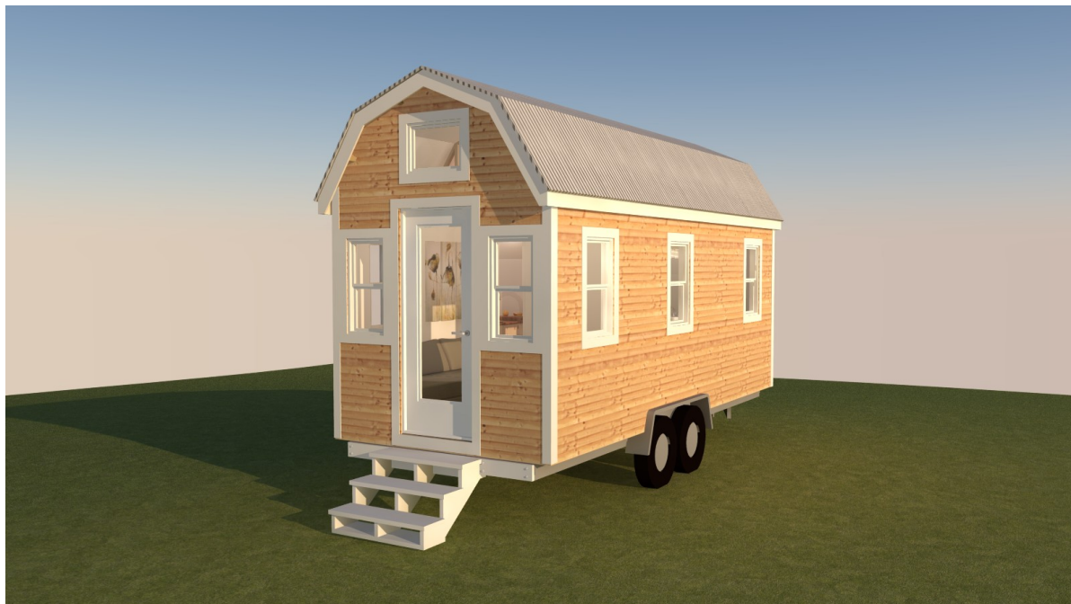
The SPARK - Dover

The SPARK Covelo is a 6 Meters long tiny house on wheels with a 10/12 gable roof. It has a bathroom sized to fit a square shower stall, composting or standard toilet, and small wall mounted sink. A small kitchen could be placed in the center of the house. A sleeping loft above the bathroom & kitchen space provide enough space for a queen-sized mattress. Two skylights and a small window open to provide ventilation in the loft.