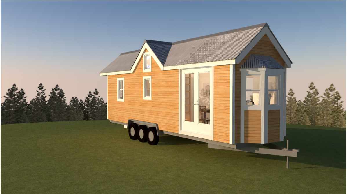
The SPARK - Lucas

The SPARK Westport is a 8.5 Meters long tiny house on wheels with a 10/12 gable roof. It has a bathroom sized to fit a square shower stall, composting or standard toilet, and small wall mounted sink. On the same wall as the bathroom is space for a stackable washer & dryer. Just outside the bathroom, the kitchen which would be placed along the opposite wall. French doors on one side provide access to the back room.