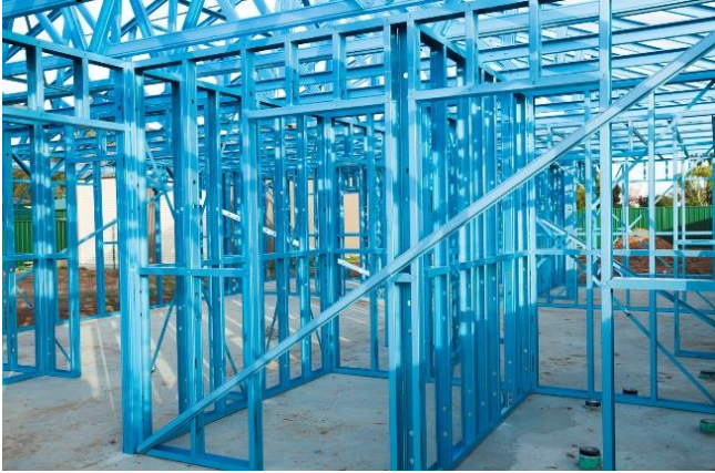
Pre-fab Steel Frame