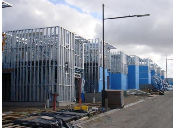
Pre-fab Steel Frame - Town Houses