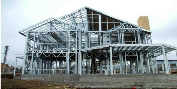
Pre-fab Steel Frame – House