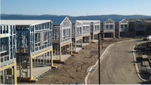
Pre-fab Steel Frame – Duplex House