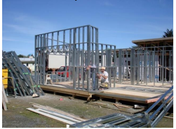
Pre-fab Steel Frame - House