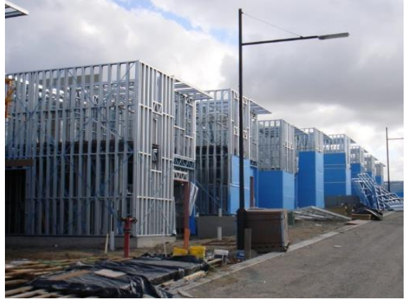
Pre-fab Steel Frame - Town Houses