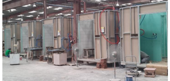
Pre-fab Steel Frame – Toilet Blocks