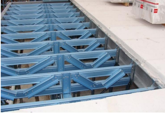
Pre-fab Steel Frame – Upper Floor