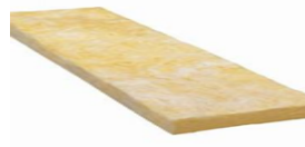
Roof Insulation, R-3