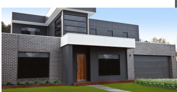
Brick Option Available