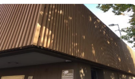
Upgraded Cladding Options at an addition cost